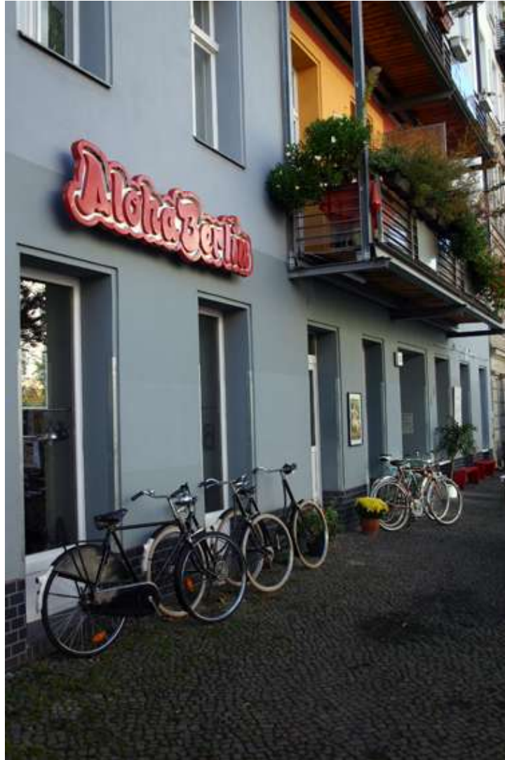
Aloha Berlin – Fahrrad mecca

Alexanderplatz. Two points to note are that you may, with care, cycle on pavements (everyone does) and also, for €1.50 take your bike on the U-bahn.