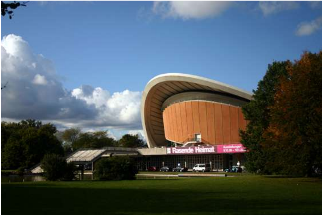
Haus der Kulturen der Welt

shell-like arc of the main auditorium hovers over a man-made lake (in which sits an enormous bronze Henry Moore 'Butterfly'). It's common knowledge that the building's unofficial name is the "Schwangere Auster" – the "pregnant oyster". Here is currently exhibited the work of two Asian artists – Tadashi Kawamata's Berlin Tree Huts and a large scale "performative installation" by Qui Zhijie. Well worth a visit.