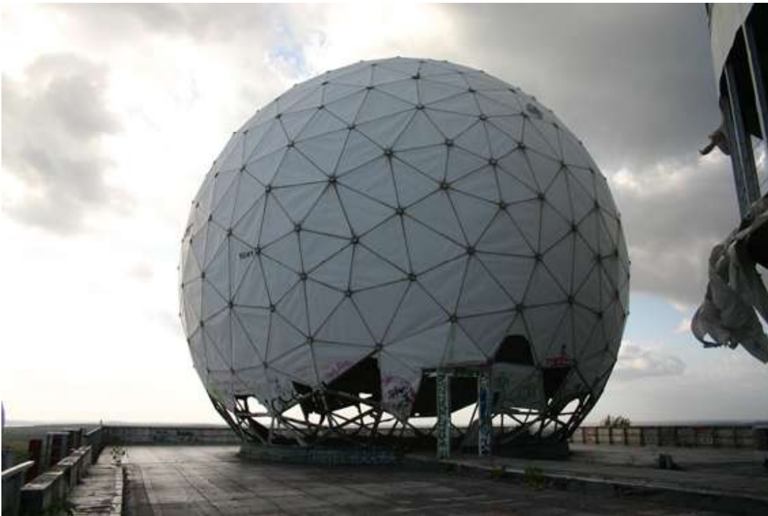
View of one of the radar spheres at Teufelsberg

former American radar station. Surrounded by a triple fence, it's possible to slip through and climb the large tower from which vantage you have an incredible view of the city and the surrounding forest.